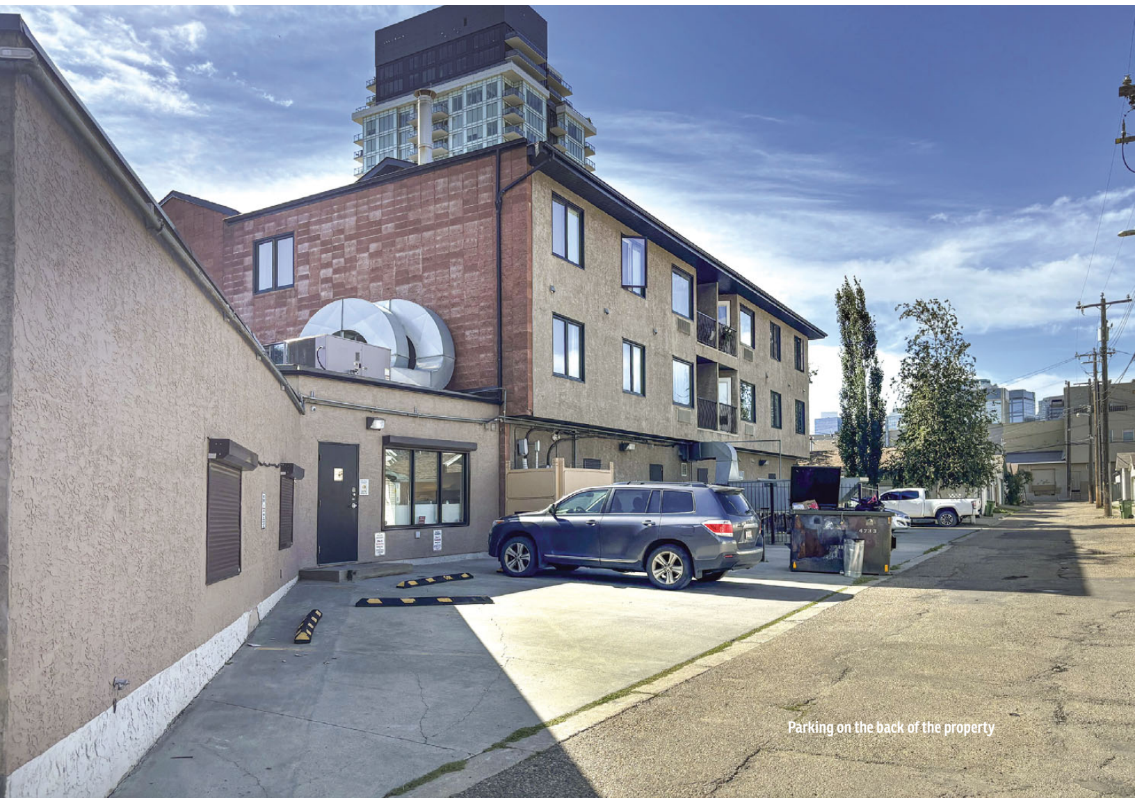
Parking on the back of the property