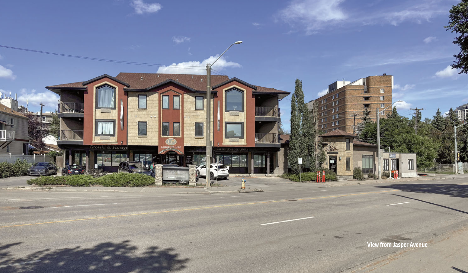
View from Jasper Avenue