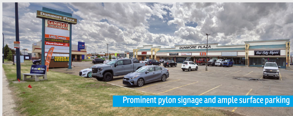
Prominent pylon signage and ample surface parking