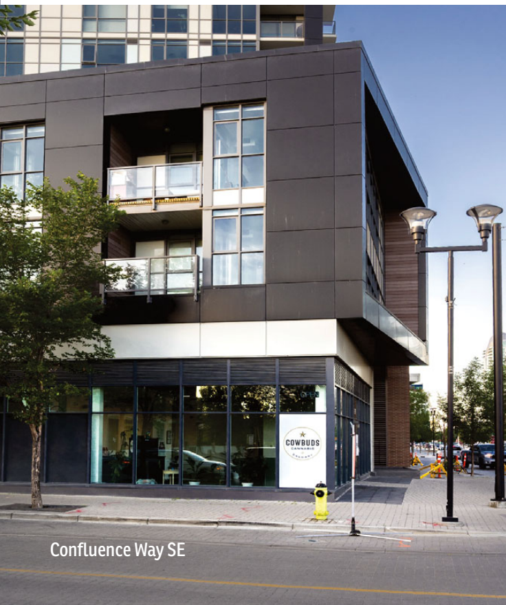
Confluence Way SE