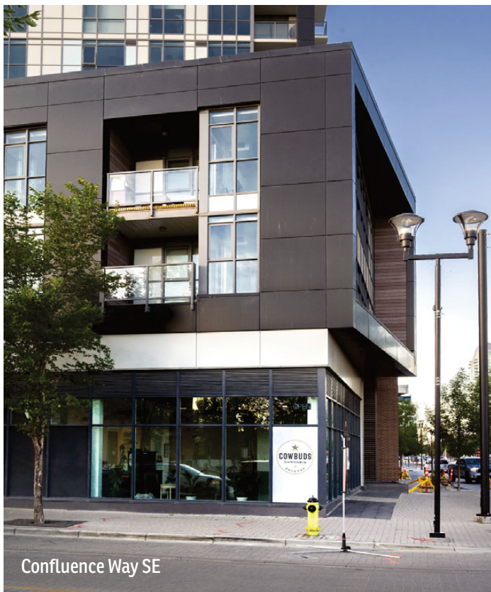
Confluence Way SE