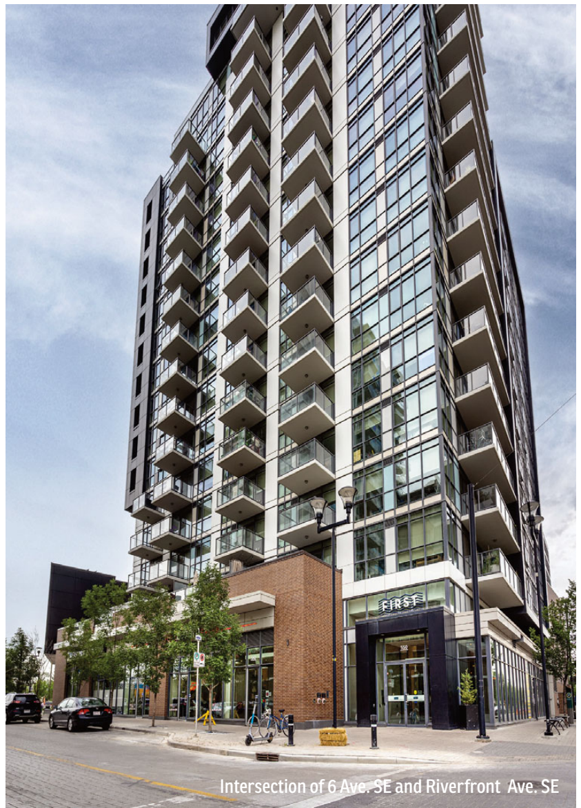
Intersection of 6 Ave. SE and Riverfront Ave. SE