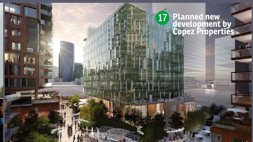
17 Planned new development by Copez Properties