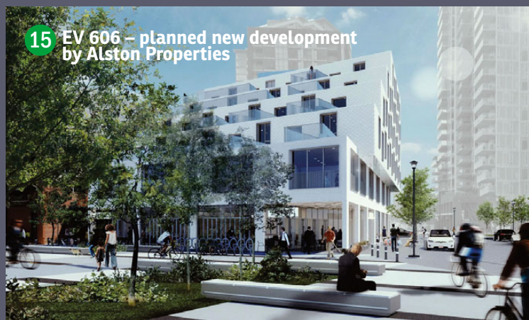
15 EV 606 – planned new development by Alston Properties